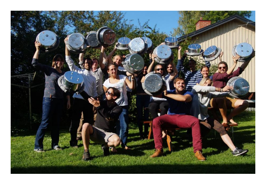
Figure 2. Group picture from the EuroRun workshop at Lake Erken in Sweden.

The chambers for the measurements were constructed during a workshop at Lake Erken, Sweden. In addition, the handling of the chamber and data analysis were taught at this workshop. It took place from the 13.-15.09.2016 and brought together 17 early career researchers (Fig. 2) who were the representatives of their respective team and hence the major contact persons for the PIs of EuroRun. It was a very stimulating atmosphere and a lot of ideas were discussed and developed during this time.